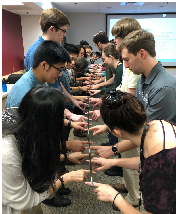
Figure 2. Discovery staff members participating in a team-building exercise.

mindset. The goal being that, in the end, as staff members leave the Discovery Program, they become both the expert and the director of their own ongoing development. Both the program leaders and curriculum structure provide the scaffolding to support them on this journey.