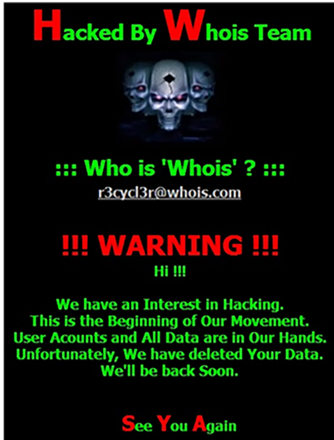
Figure 3. One of the Messages Sent by Whols Team in March 2013 47,48

the #GOP attack). 45 The technical analysis and contemporaneous reporting of statements by unnamed government officials 46 attributed the March 2013 attack to North Korea.