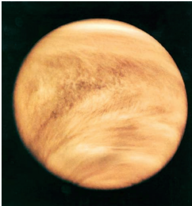
Figure 1. A UV image of thick clouds on Venus taken by the Pioneer Venus Orbiter (26 February 1979). Venus rotates very slowly, taking 243 days to complete one revolution. By tracking the cloud features, it is found that the clouds travel quickly around the planet, taking only 4 days to circulate once, indicating superrotational winds at the cloud level. Both the winds and the solid planet rotate from east to west, opposite to the direction on Earth. The Y-shaped cloud patterns move from right to left in the figure.

A long-standing problem in planetary atmospheric dynamics is the maintenance of equatorial superrotation in the atmospheres of slowly rotating planets. Strong equatorial superrotational zonal winds of \approx 100 \text{ m s}^{-1} (Fig. 1) were first observed at Venus' cloud-top level in the 1960s, 8 consistent with an atmospheric angular velocity nearly 60 times greater than the rotation of the solid planet! Several mechanisms have been proposed to explain the generation or maintenance of the superrotation of clouds on Venus.